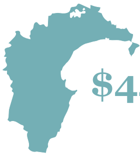
HAWKE'S BAY GDP PER CAPITA