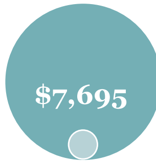
GDP VALUE, (MILLION)