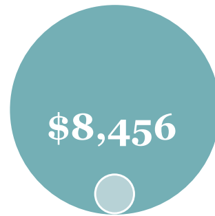
GDP VALUE, (MILLION)