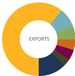
EXPORT PRODUCT MIX FY2021 (WEIGHT)

5.9 MILLION TONNES OF TOTAL CARGO VOLUME HANDLED