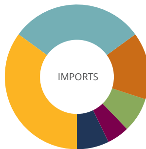
FY2021 ALL CARGO IMPORTS (WEIGHT)